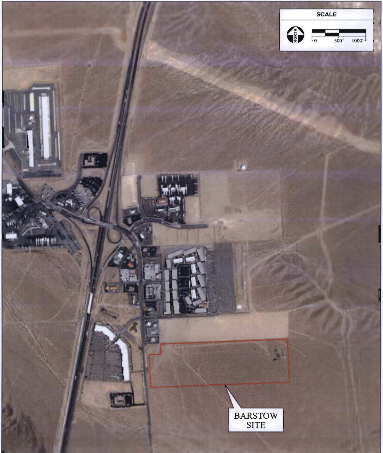
Figure 3 Aerial Site Map - Proposed Site